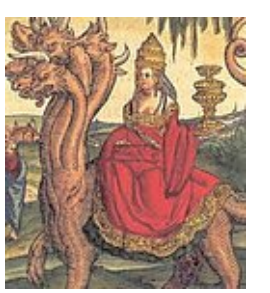
A Tarot card depiction of Pope Joan as the Antichrist astride the seven-headed beast of the apocalypse. This depiction was likely created as Protestant anti-papal propaganda.

While official Vatican lists of the popes do not include any mention of a female pope, it appears that the story was widely believed by the general public by at least the thirteenth century. Indeed, the collection of busts of popes in Siena Cathedral once included one of Pope Joan. However, as the Renaissance progressed,